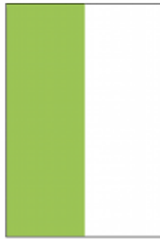
1/2 page Vertical 3 \frac{5}{8} \times 9 \frac{7}{8}