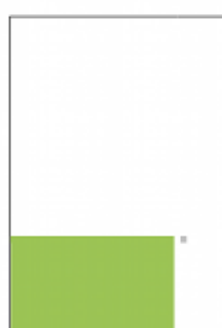
1/4 Page Horizontal 4 \frac{7}{8} \times 3 \frac{5}{8}