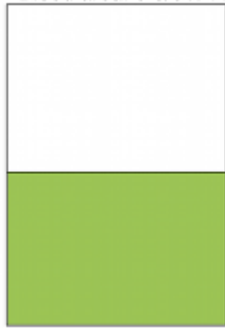
1/2 Page Horizontal 7 \frac{3}{8} \times 4 \frac{7}{8}