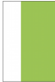
2/3 Page Vertical 4 \frac{7}{8} \times 9 \frac{7}{8}