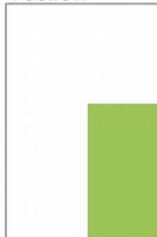
1/4 page Vertical 3 \frac{5}{8} \times 4 \frac{7}{8}