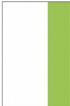
1/3 page Vertical 2 \frac{3}{8} \times 9 \frac{7}{8}